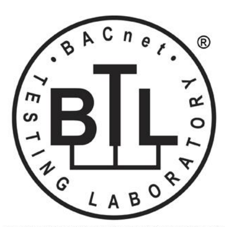
BACnet is a registered trademark of ASHRAE. ASHRAE does not endorse, approve or test products for compliance with ASHRAE standards. Compliance of listed products to requirements of ASHRAE Standard 135 is the responsibility of the BACnet International. BTL is a registered trademark of the BACnet International.